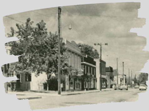
Millsboro's Main Street from Millsboro Trust Co.